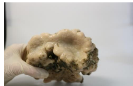
Sponge sample Ecionemia novaezealandiae

A key science question for our research is ‘how resilient will the “knobbly sandpaper sponge” Ecionemia novaezealandiae and the stony coral Goniocorella dumosa be to sediment plumes. Experiments have been completed on the sponge samples and results from assessing sponge health and survival, at different levels of suspended sediment concentration, are now being worked up.