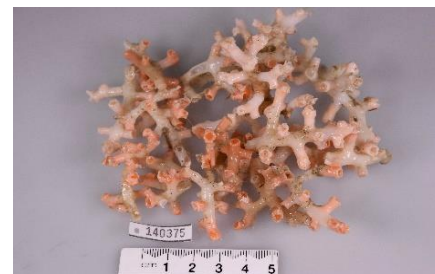
Deep-sea stony branching coral colony Goniocorella dumosa

Next week the experiment on several coral colonies branch segments, kept alive so far for 5 months, will begin. The corals have been fed regularly and maintained in water temperature and current conditions similar to those found in the Survey Area. The coral segments held in our tanks remain pink and healthy with their polyp tentacles extended.