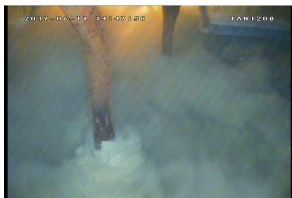
Images from the video cameras mounted on SCIP showing the sediment plume

The second survey under this programme took place in June to monitor changes at sites sampled in 2018, and to undertake some further disturbance. In this flyer we describe the use of the Sediment Cloud Induction Plough (SCIP) to observe Direct physical disturbance , the Moorings deployment for longer-term measurements and the Sedimentation experiments on sponges and corals.