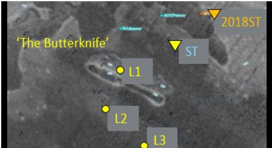
Benthic lander sites (L1, L2, L3) and 'Baseline' sediment trap moorings (2018ST and ST) deployed during the 2019 survey at the 'Butterknife' seafloor feature on the crest of the Chatham Rise in ~ 400 m water depth.

BY LEE RAUHINA-AUGUST, MALCOLM CLARK, DI TRACEY